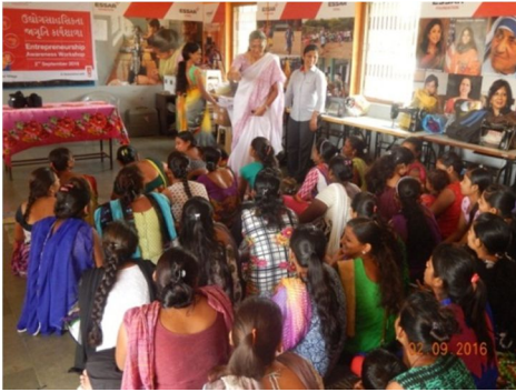
Participants of Essar Foundation Awareness program attentively listening to the trainer.