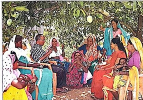
Women attend a workshop organized by the NGO I Create.