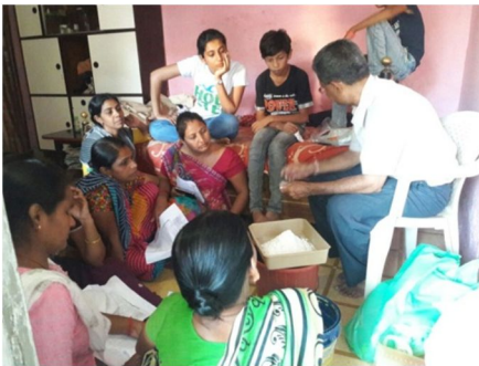
Participants at Ekta Nagar awareness program.