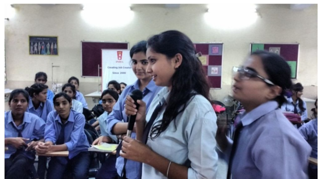
Students of Govt. ITI (women), Jaipur presenting their Business Plan