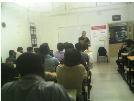
Participants of Rustomjee EAP during the program.