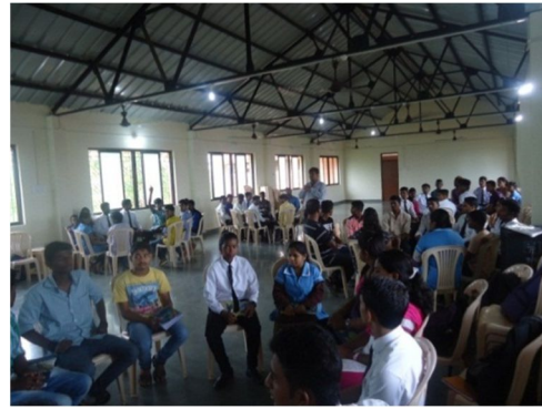
Participants of Don Bosco, Goa during a group discussion.